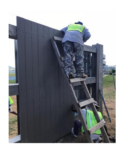
Activity 4: Trackside Fence